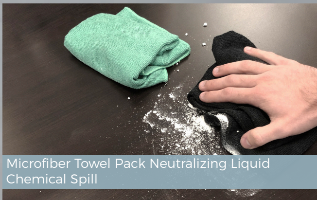
Microfiber Towel Pack Neutralizing Liquid Chemical Spill