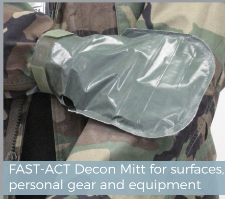
FAST-ACT Decon Mitt for surfaces, personal gear and equipment